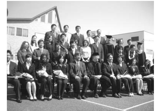
2007 Graduation GPA is selected as the salutatorian.

All members of the KIU community are invited to attend the graduation ceremony. Friends and relatives of the graduates are also welcome to attend.